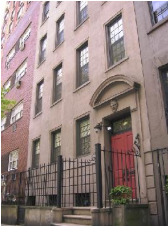
Women's Center, Opened 2004 Upper East Side