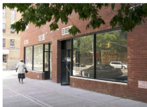
New Children's Operating Location, Opened 2014 South Bronx