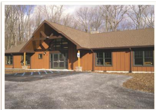
Multiple new buildings at Mont Lawn Camp e.g... Retreat Lodges, (above) Arts Center, Seneca and Leadership Hill Bushkill, PA