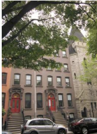
New Women's Facilities Acquired 2012, Renovated 2013-2014 Central Harlem