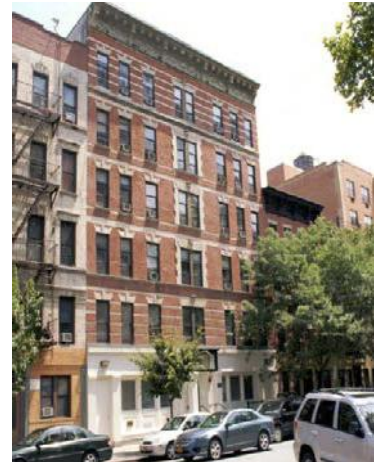
New Men's Facility Acquired 2013, East Harlem